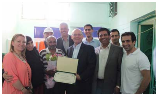
The first beneficiary of the Wastewater Network Project

As part of Wastewater Network Project, Water Authority of Jordan (WAJ) in Zarqa will be afforded a new administration building. The new building will enhance the operation and maintenance activities by placing them in the same location and creating more space for customer service.