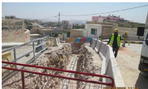
High standards of health and safety measures

The four (4) contracts providing the construction for the Wastewater Network Project are as follows: