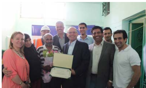
The first beneficiary of the Wastewater Network Project

As part of Wastewater Network Project, Water Authority of Jordan (WAJ) in Zarqa will be afforded a new administration building. The new building will enhance the operation and maintenance activities by placing them in the same location and creating more space for customer service.