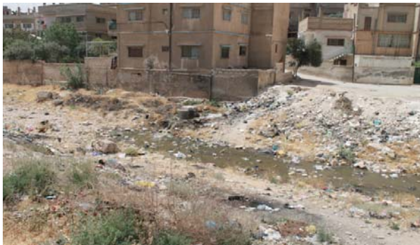
Sewage overflow is a consistent problem in Zarqa Governorate

The US Government's Millennium Challenge Corporation (MCC) signed a five-year, $275.1 million Compact with the Hashemite Kingdom of Jordan on October 25, 2010 to reduce poverty through economic growth. The Compact will increase the supply of water available to households and businesses and help improve the efficiency of water delivery, wastewater collection, and wastewater treatment in the Zarqa Governorate, northwest of the capital Amman and one of the poorest and most populated areas in the Kingdom.